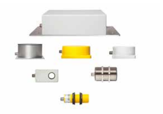
Inductive analogue sensors