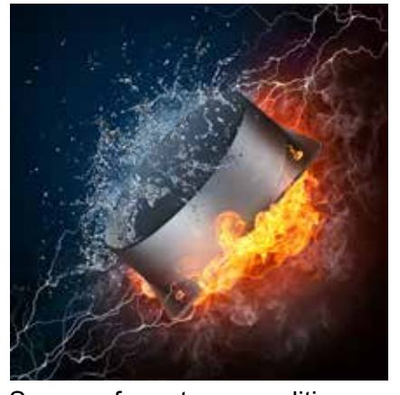
Sensors for extrem conditions